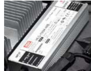
5 years warranty driver