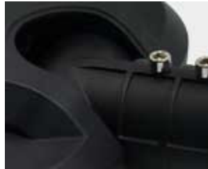
Adjustable angle lamp arm