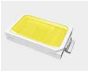
PHILIPS 140lm/W LED chip