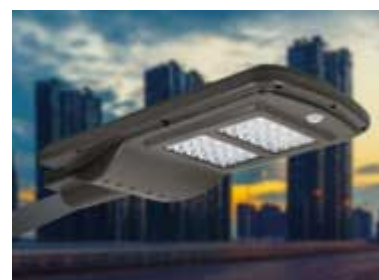
15W-30W Solar Garden Light