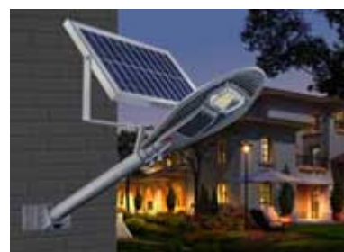
10W-30W Solar Garden Light