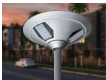
15W-30W Solar Garden Light