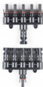
1 To 5 connector