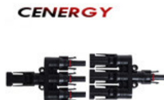
1 To 3 connector