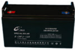
Lead crystal Battery