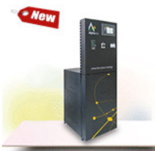
EES CENTAURI SERIES