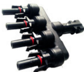
1 To 4 connector