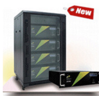
EES STORION - ECO