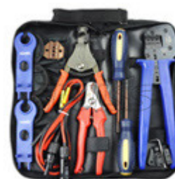
Crimping tool Package