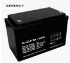
Lead acid Battery