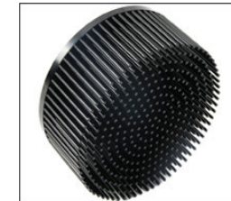
OD163mm Watts 75-90W