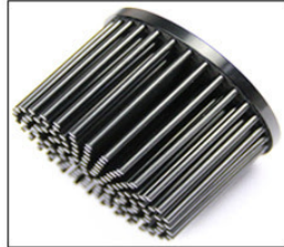
OD70mm Watts 5-8W