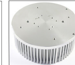
OD180mm Watts 80-100W