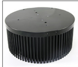
OD150mm Watts 55-75W