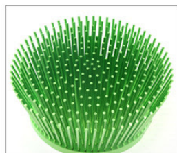
OD163mm Watts 90-98W