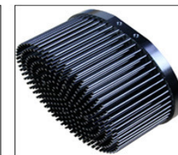
OD133mm Watts 40-45W