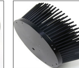
OD150mm Watts 60-80W