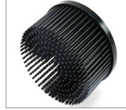
OD105mm Watts 10-12W