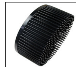
OD120mm Watts 35-40W