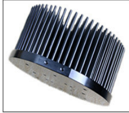
OD80mm Watts 6-9W