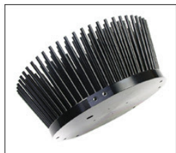
OD180mm Watts 95-120W