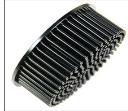
OD87mm Watts 6-10W