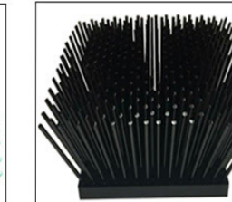
150*150mm Watts 185-200W