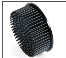
OD115mm Watts 25-30W