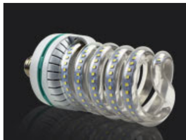
LED Corn Light