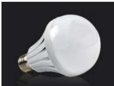
LED Emergency Bulb