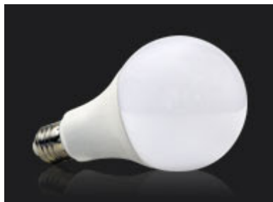
PC + Aluminum LED Bulb