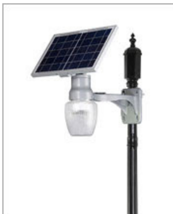
6W-12W Solar Garden Light