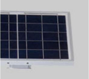
Poly solar panel 18% photoelectric conversion rate