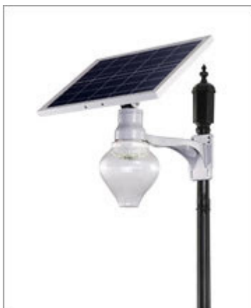
6W-12W Solar Garden Light