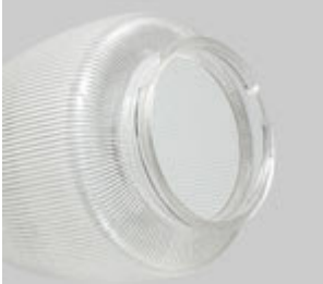
Outdoor anti-ultraviolet PMMA Lampshade