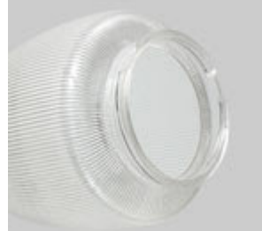
Outdoor anti-ultraviolet PMMA Lampshade