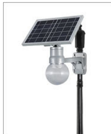
6W-12W Solar Garden Light