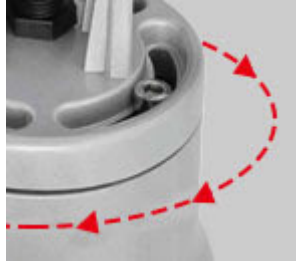
Solar panel can be adjustable 360 degree free to rotate