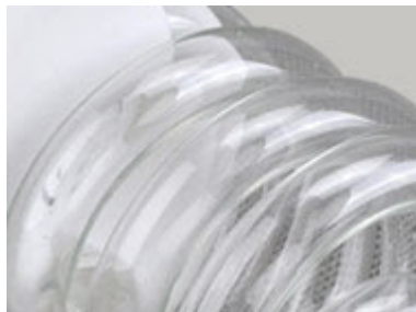
High transmittance glass lampshade