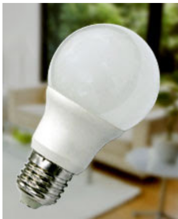
PC&Aluminum LED Bulb