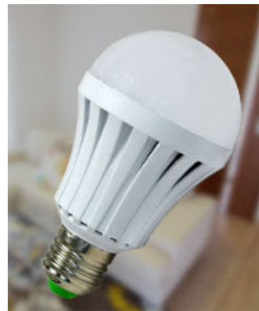
LED Emergency Bulb