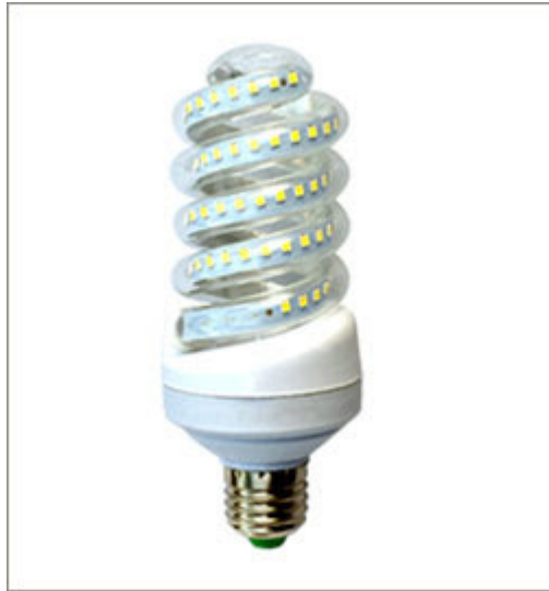
S Shape LED Corn Light