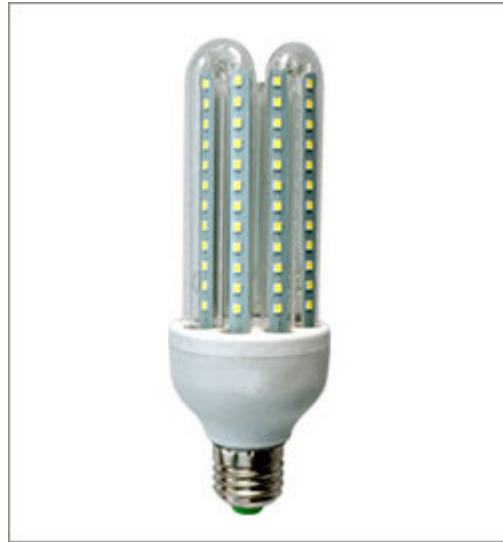
U Shape LED Corn Light