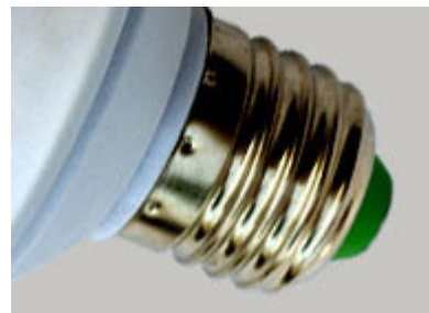
Adopting E27 light base