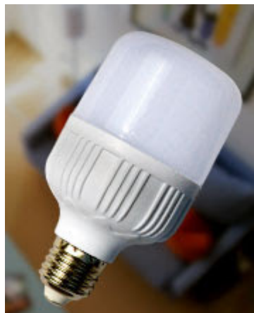
High Power LED Bulb