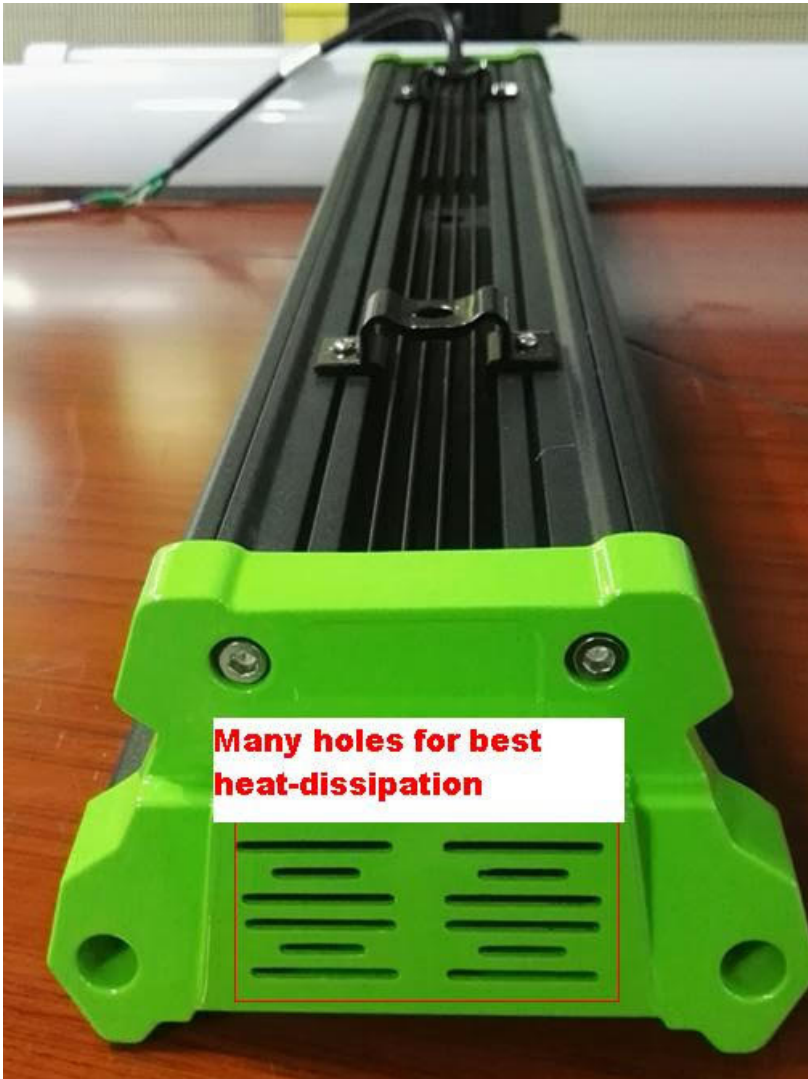
3. Glue the wire directly during the production of connecting the two moulds, real IP65 waterproof