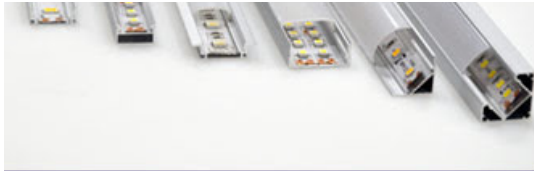
Aluminum Profile,excellent heat dissipation