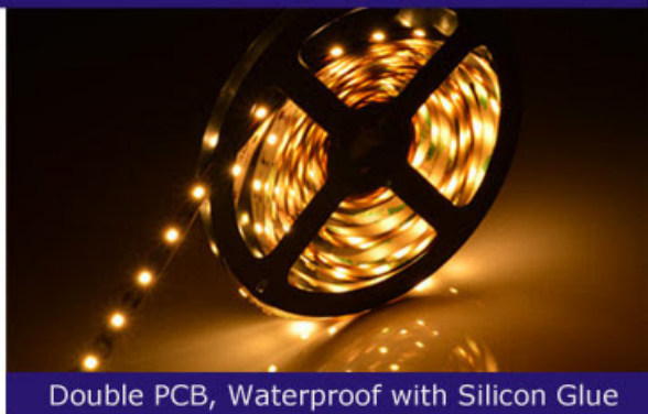
Double PCB, Waterproof with Silicon Glue