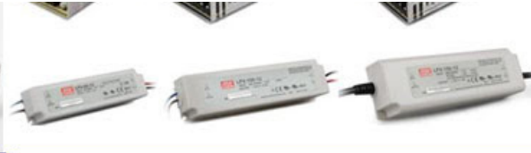
DC12/24V, High quality, Agent Price