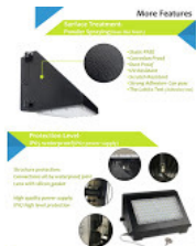
LED WALL PACK.jpg 93K