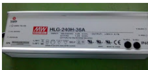
Meanwell led driver2.jpg 71K